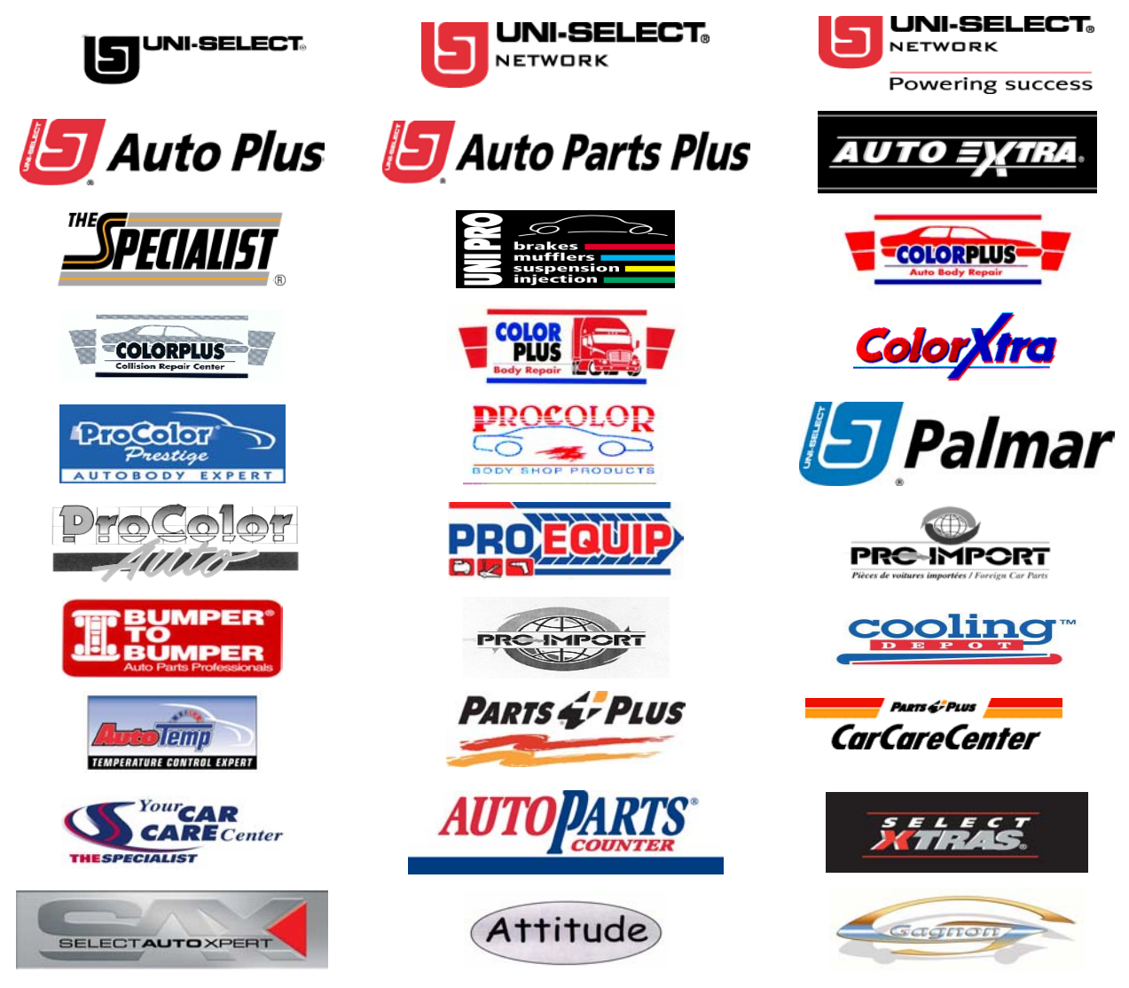
Uni-Select considers that all of its trademarks are useful but not essential to marketing its goods and services.

In the course of its activities, the Automotive and Heavy Duty Groups of Uni-Select use many trademarks and business names, some of which include a logo, including: