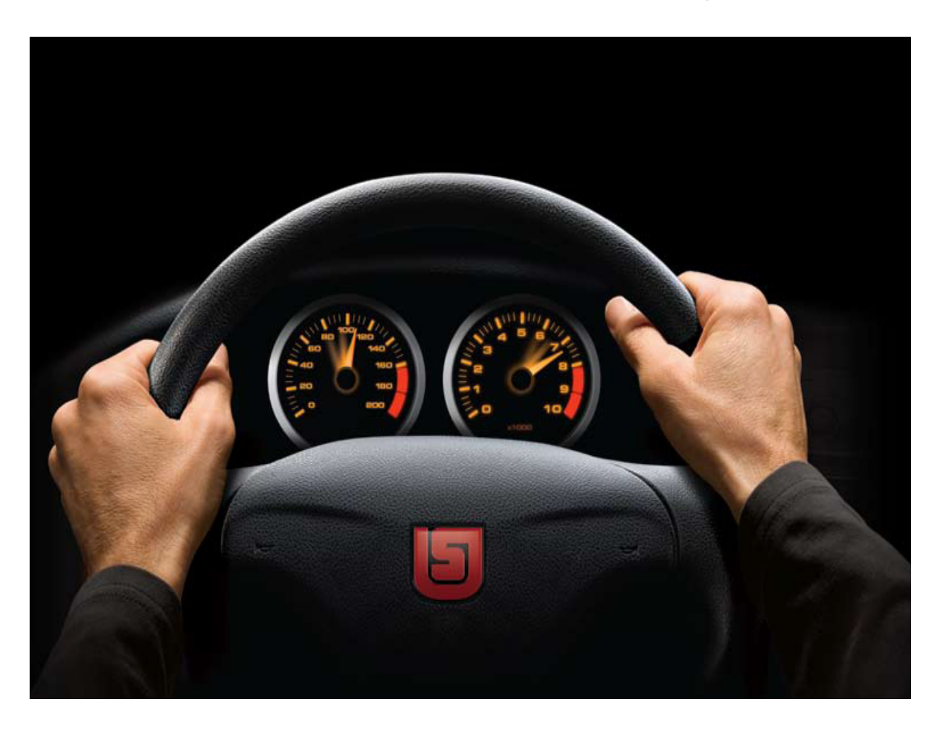
3<sup>rd</sup> quarter period ended September 30, 2008